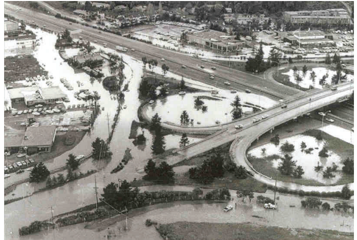
Flooding within Corte Madera in 1982

Flooding within the Town of Corte Madera is caused by three sources: extreme high tides, storm water runoff, and in certain areas substandard storm drainage infrastructure. Floodwaters can spread over many blocks, reaching depths of up to two or three feet, and covering streets and yards. This can lead to flooding of parked vehicles, garage areas, basements, and lower floors of structures.